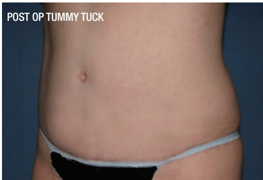
POST OP TUMMY TUCK